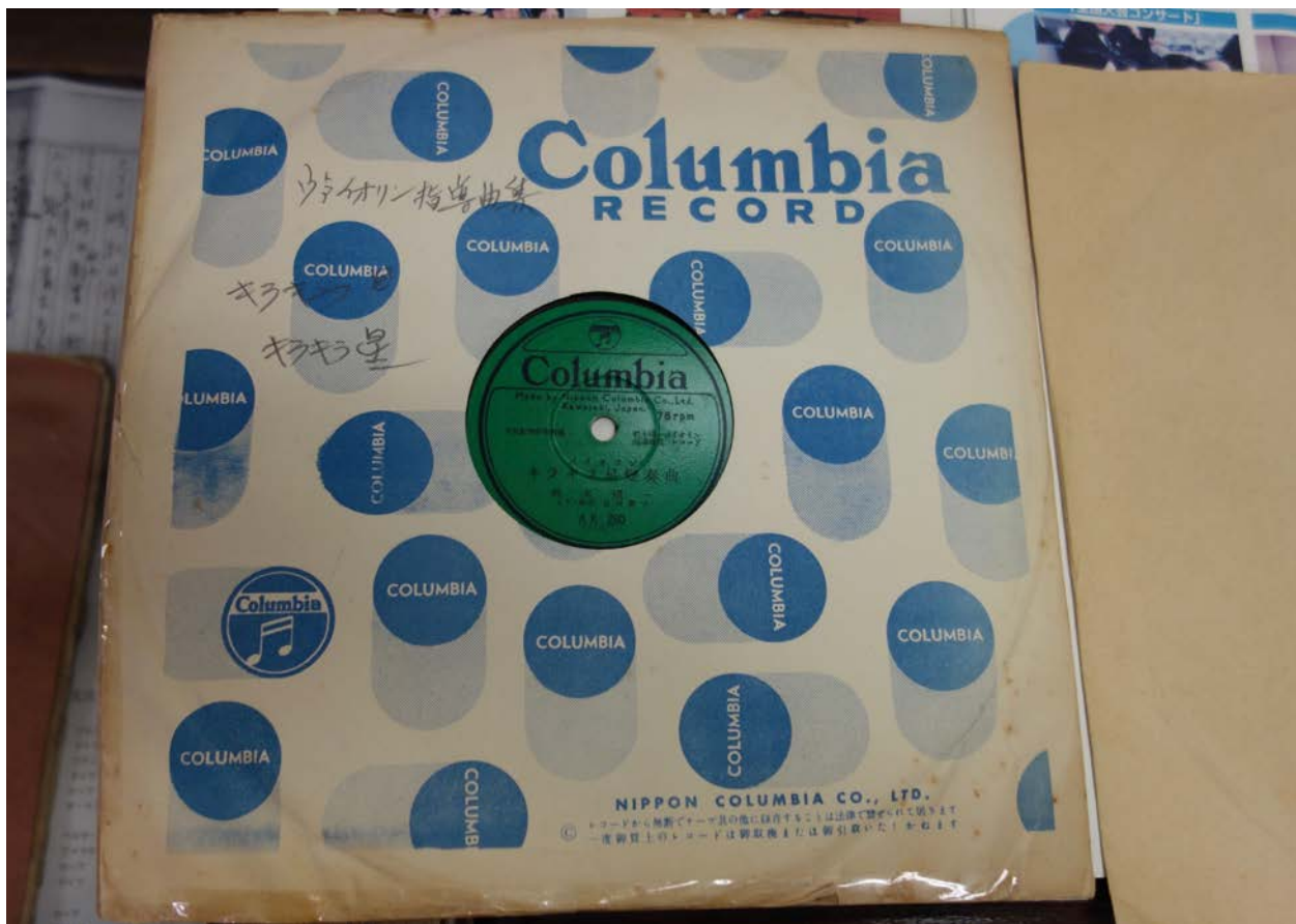
Figure S3: Suzuki's personal copy of the 78rpm recording of Twinkle, Twinkle, Little Star Variations , released in 1947 for Nippon Columbia.