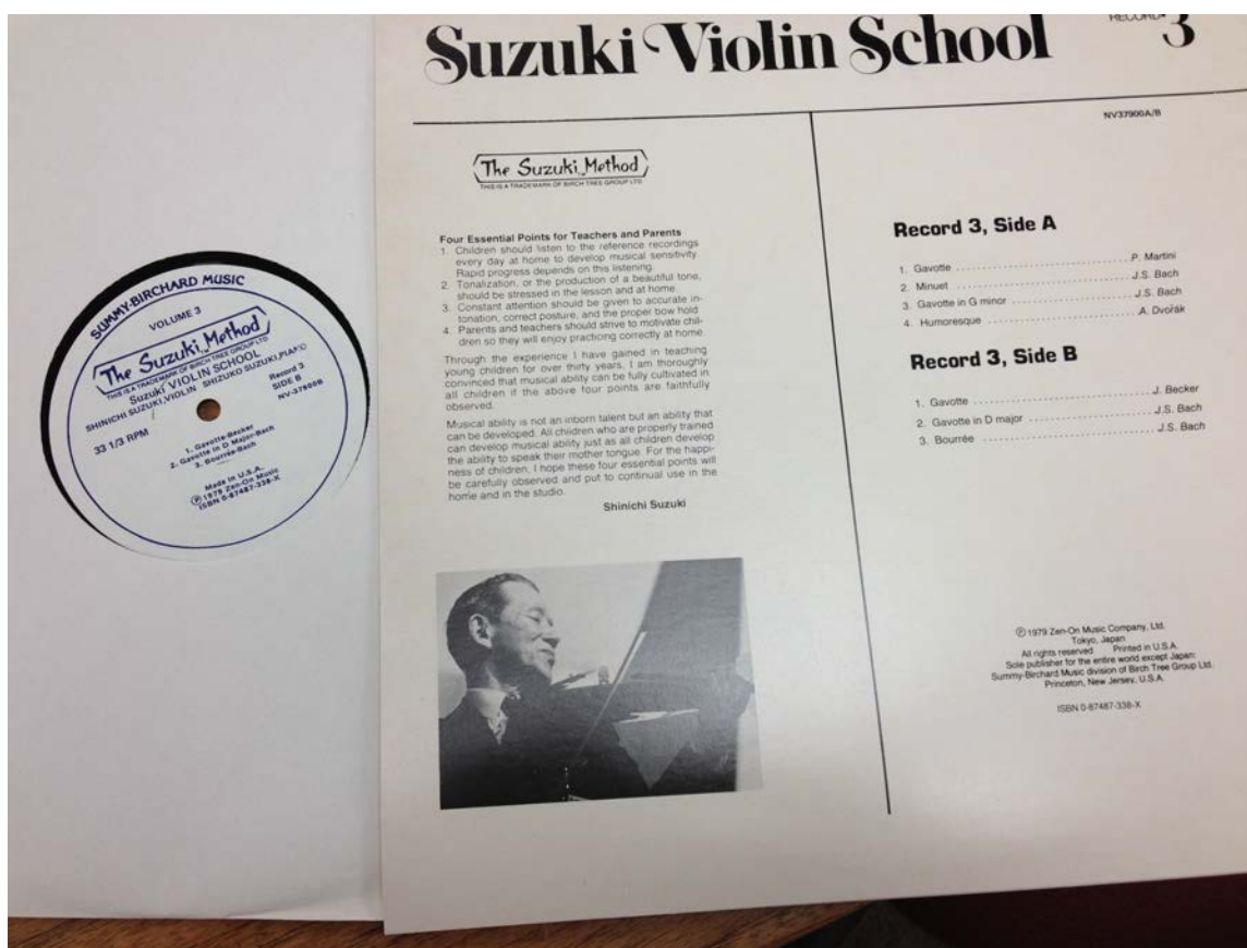
Figure S5: Various releases in 45RPM and 33RPM LP of Suzuki's recordings at the Suzuki Shinichi Kinenkan (Suzuki Museum).