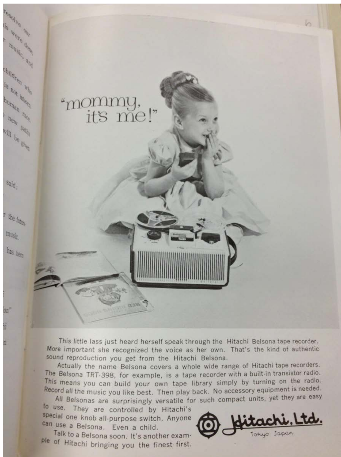
Figure S7: This advertisement one of only two images of recording equipment found in the course of study (see also Figure 8). It accompanied an explanation of Suzuki's Method that was distributed on one of his American tours.