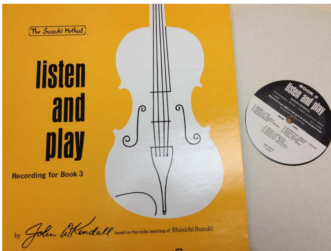
Figure S4: Image of the Listen and Play album.