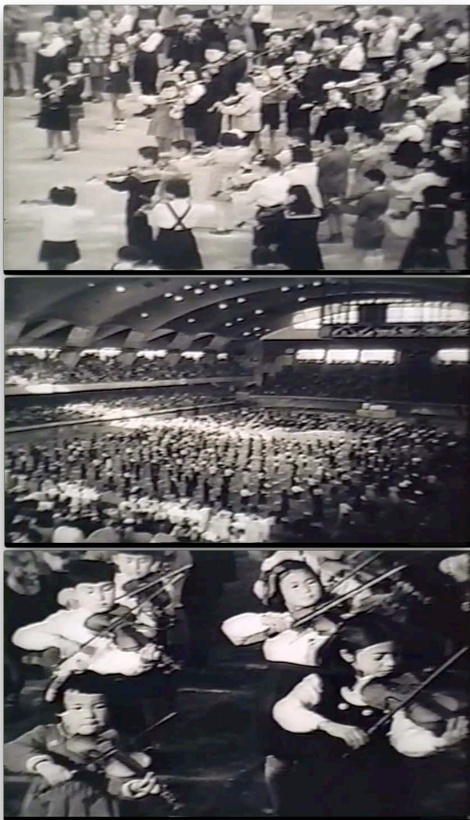
Figure S2: Additional images from the film of the first mass graduation concert.